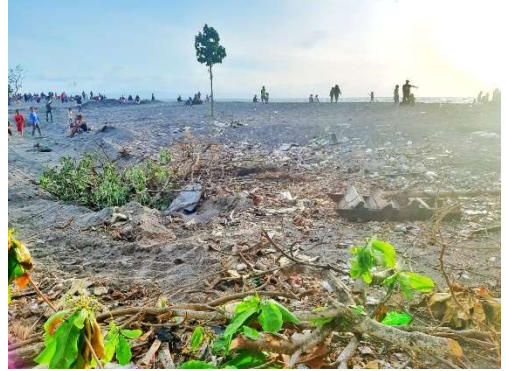
Figure 2. Condition of garbage at Loang Baloq beach

The lack of it in the toilet is a bit dirty; the same garbage is scattered (interview, 2021)