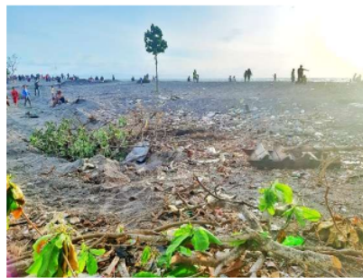
Figure 2. Condition of garbage at Loang Baloq beach

The lack of it in the toilet is a bit dirty; the same garbage is scattered (interview, 2021)