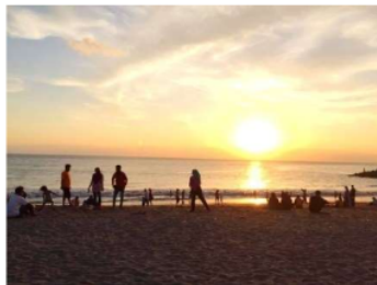
Figure 1. Panorama Sunset Loang Baloq beach

So if the potential is certainly huge because it is very close to reaching the city center, the potential for its development is more of a push into a recreational and sports tourism destination (interview, 2021).