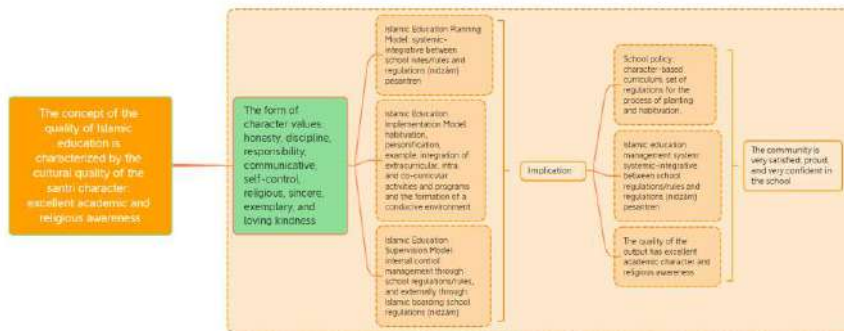
Figure 2. Management model of Islamic education with the character culture of Santri 's character quality

The Islamic education management model is characterized by the quality of the character culture of students in preparing the quality of outputs in schools and how character education is planned, implemented, and adequately monitored in school activities. The development of character values is based on good-quality Islamic education with excellent academic character and religious awareness. Excellent academic values developed are integrity, self-discipline, accountability, communication, self-control, and values of religious awareness which were developed are religiosity, sincerity, exemplary role model, love-kindness, all of which are developed using the principle of exemplary approach and systems approach.