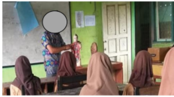
Figure 1. Exploring Akhlak Karimah Value through Torso Pro

2 and the learning objectives. R3 employed a variety of approaches to teach the topic of "Buying and Selling." All students actively participated, and they were involved in role-playing scenarios that involved legal transactions of banana fruits. This diverse teaching strategy yielded enthusiastic responses from the students and effectively reinforced the three moral ideals. As a visual aid, R3 used a portion of a blackened banana to exemplify that it should not be sold. In the study, Figures 1 and 2 provide illustrations depicting how good manners can enhance the overall learning experience.