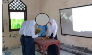
Figure 2: An Example of Exploring Akhlak Karimah through Banana

Examination questions conveyed messages associated with akhlak karimah values. The value of gratitude was clearly present in the "Living Things" question, specifically in items 3 and 5 of the Science Question Document from a class VII session held on December 2, 2021, between 07:00 and 08:30 local time (WITA). Similarly, the value of honesty was evident in the "Selling and Buying" question, particularly in items 3 and 5 of the Fikih Question Document from a class XI session conducted on October 6, 2021, between 07:00 and 08:30 WITA. Examples of these test questions can be found in Figures 3 and 4 within the study.